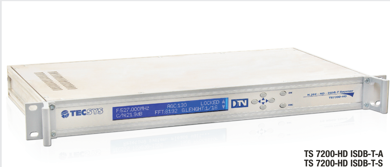
TS 7200-HD ISDB-T-A TS 7200-HD ISDB-T-S